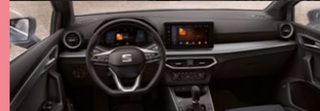
LE MANS CLOTH BUCKET SEATS 2