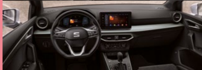
DINAMICA ® BLACK SPORT SEATS