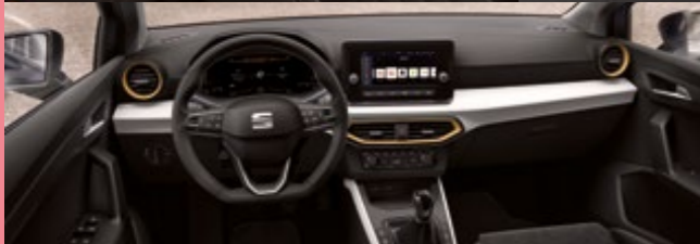
DINAMICA ® BLACK SPORT SEATS