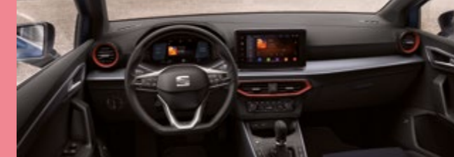
LE MANS CLOTH SPORT SEATS 2