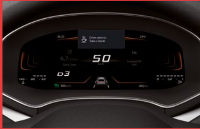
Centred around you All your driving data at a glance. The fully digital 8" cluster displays all your essential driving data front and centre and is customisable to suit your preferences.

Bigger screen, bigger visibility, bigger adventures. The SEAT Arona Reference trim is built for reliability and comfort in the great outdoors. With clever space to accommodate all your passions, connectivity for contemporary living, and the technology to get you there without a hitch.