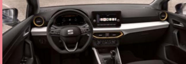
COMO CLOTH COMFORT SEATS