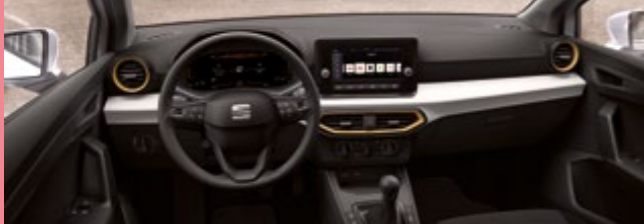
ACERO CLOTH COMFORT SEATS