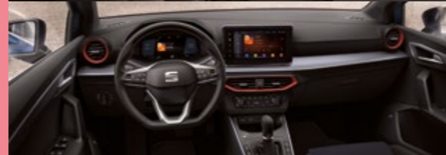
DINAMICA ® BLACK SPORT SEATS 2