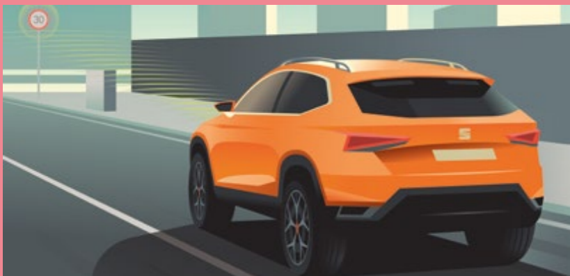
Traffic Sign Recognition See the current speed limits and overtaking restrictions on the Digital Cockpit. All thanks to the integrated front camera.