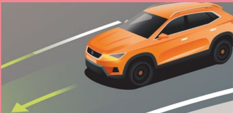
Travel Assist A little helping hand. Travel Assist monitors your journey using cameras to scan for upcoming traffic, lane markings and curves, adjusting your speed to keep you moving with the flow of traffic.