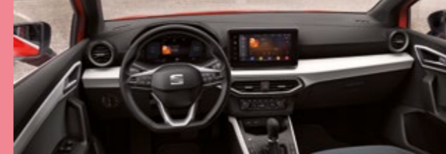
SANO CLOTH COMFORT SEATS