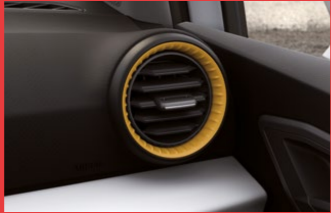
Delightful details Airvents in Honey Mustard give a dash of colour to your dash.