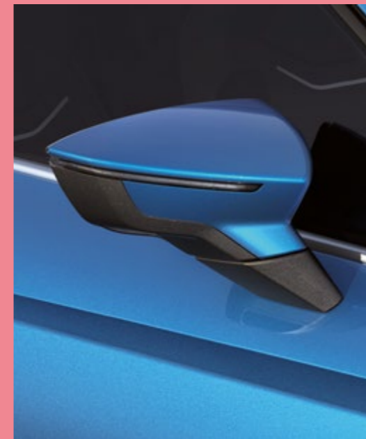
SAPPHIRE BLUE 2