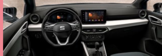
CALELLA SEAQUAL 1