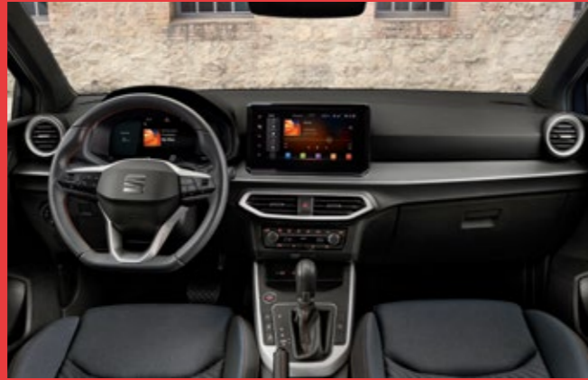
Close up of door moulding Exclusive interior with a futuristic twist. Dark Aluminium Matt door moulding, sleek silver metallic Titan Schwarz CLIP door panels & interior diffusers.

Introducing the 2024 Arona FR Limited Edition in Graphene Grey with exclusive 18" Cosmo Grey wheels, optional bucket seats and other premium enhancements.