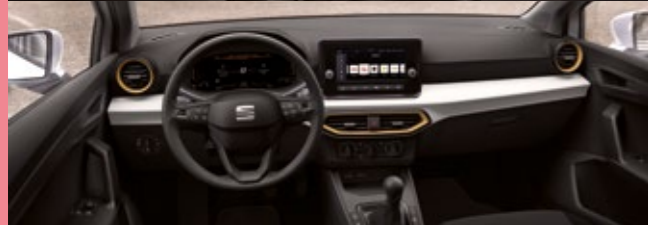
ACERO CLOTH COMFORT SEATS