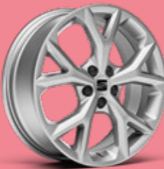
DYNAMIC 17" SPORT BRILLIANT SILVER ALLOY WHEELS