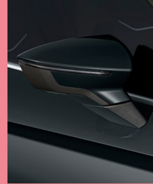
FIORD BLUE 1