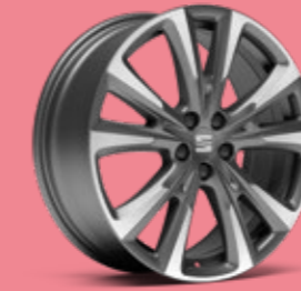
PERFORMANCE 18" COSMO GREY ALLOY WHEELS 2