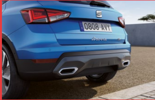
Redesigned rear diffuser The exclusively designed rear diffuser brings out the ultimate sportive look of your SEAT Arona FR.

Sporty, athletic and made to go the distance, the ready-for-anything FR trim flexes its muscles with redesigned rear diffuser and 18" Machined Alloy wheels. While the Beats Audio® sound system provides the perfect acoustics to inspire you to beat your personal best.