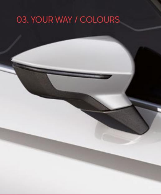
CANDY WHITE 1,5