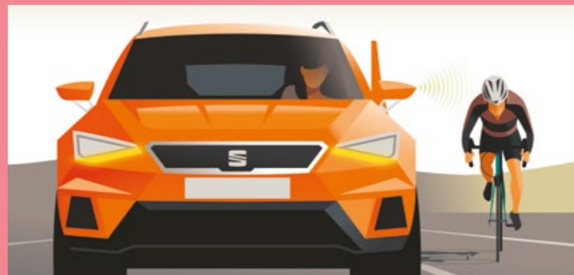
Side Assist An extra eye on your blind spot. You're always aware of incoming cars when changing lanes or overtaking.