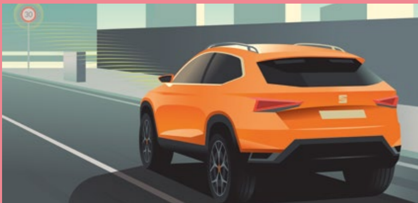
Traffic Sign Recognition See the current speed limits and overtaking restrictions on the Digital Cockpit. All thanks to the integrated front camera.