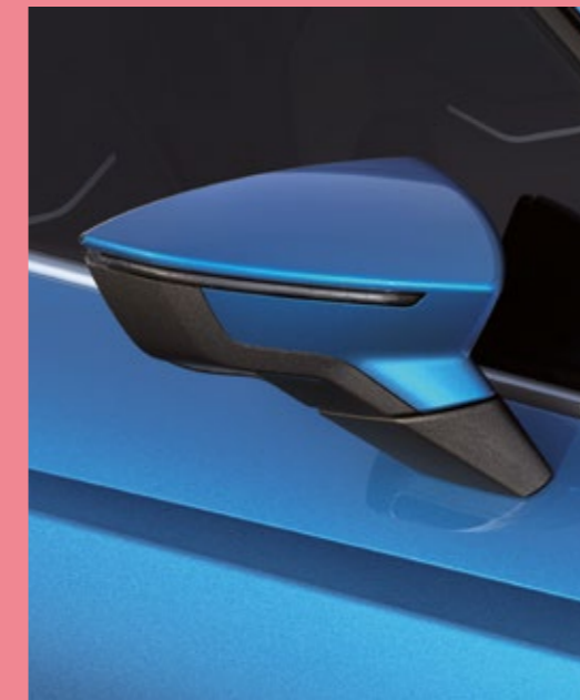
SAPPHIRE BLUE 2