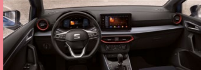
LE MANS CLOTH SPORT SEATS 2