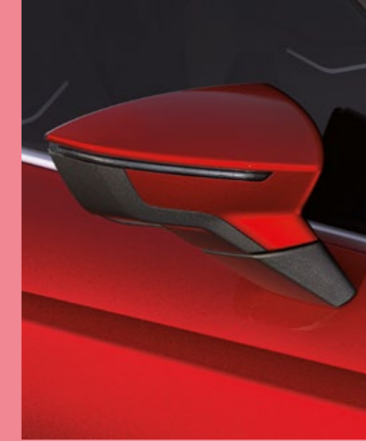
DESIRE RED 3