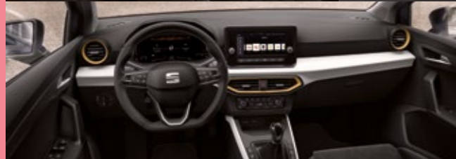
DINAMICA ® BLACK SPORT SEATS