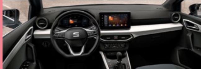
CALELLA SEAQUAL 1