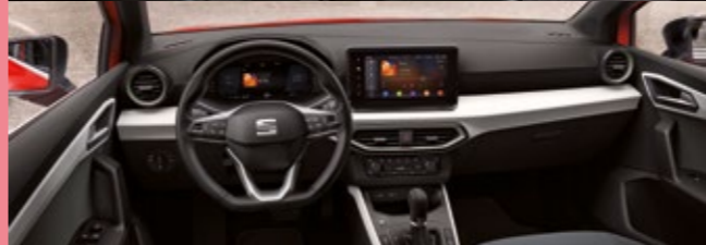
SANO CLOTH COMFORT SEATS