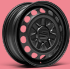
DESIGN 16" STEEL WHEELS