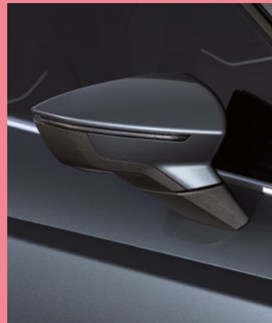
MAGNETIC TECH 2

5 Only available for fleet customers (country by country).