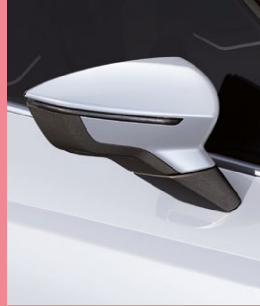
GLACIAL WHITE 2