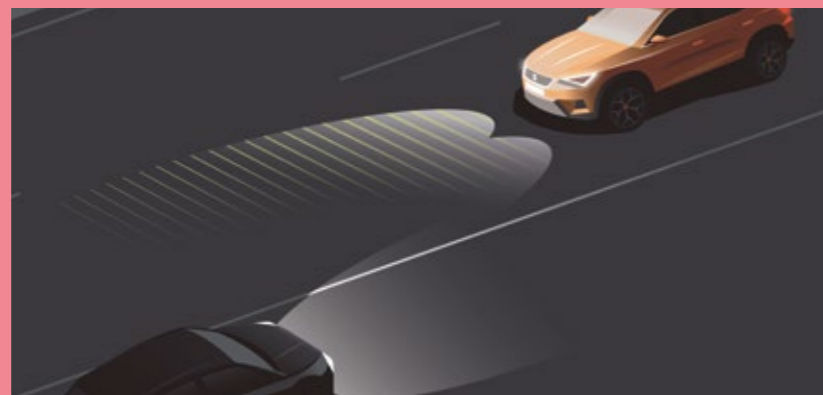
High Beam Assist This system automatically switches headlights between low and high beam when detecting a vehicle ahead, reducing dazzle to other drivers to support safer driving.