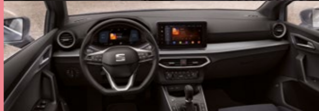
LE MANS CLOTH BUCKET SEATS 2