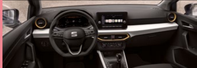
COMO CLOTH COMFORT SEATS