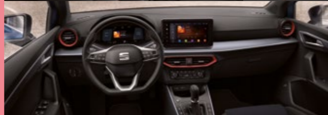
DINAMICA ® BLACK SPORT SEATS 2