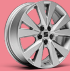
DYNAMIC 17" BRILLIANT SILVER ALLOY WHEELS