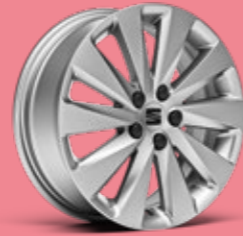
DESIGN 16" BRILLIANT SILVER ALLOY WHEELS