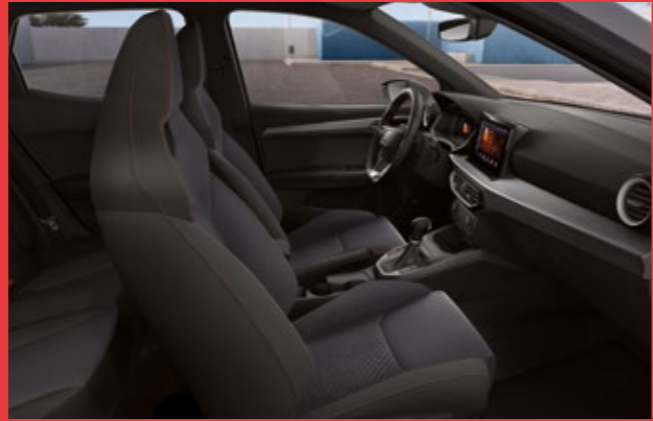
Bucket Seats Enjoy exceptional comfort and sporty design with exclusive optional front bucket seats for the 2024 Arona FR Limited Edition.