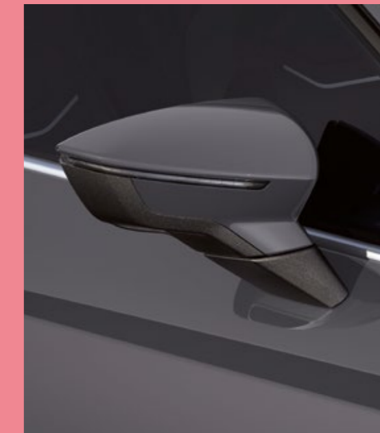
GRAPHENE GREY 3,4