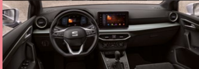
DINAMICA ® BLACK SPORT SEATS