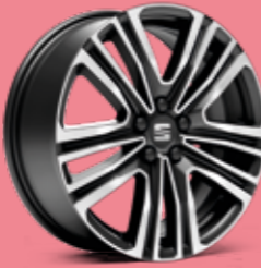
DYNAMIC 17" SPORT BLACK ALLOY WHEELS 1