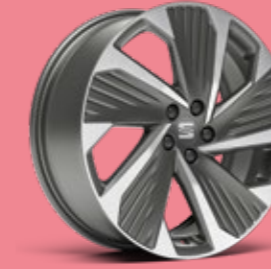
PERFORMANCE 18" COSMO GREY MATTE MACHINED ALLOY WHEELS