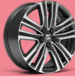
DYNAMIC 17" NUCLEAR GREY MACHINED ALLOY WHEELS