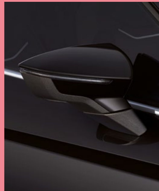
MIDNIGHT BLACK 2