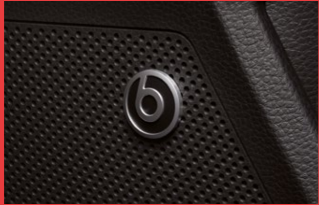
Unbeatable sound Beats Audio® includes 6 premium speakers, a thumping subwoofer for your bass-heavy tracks and a powerful 300W amplifier for supreme sound clarity on all your playlists.