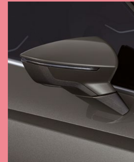
CLIFF GREY 3