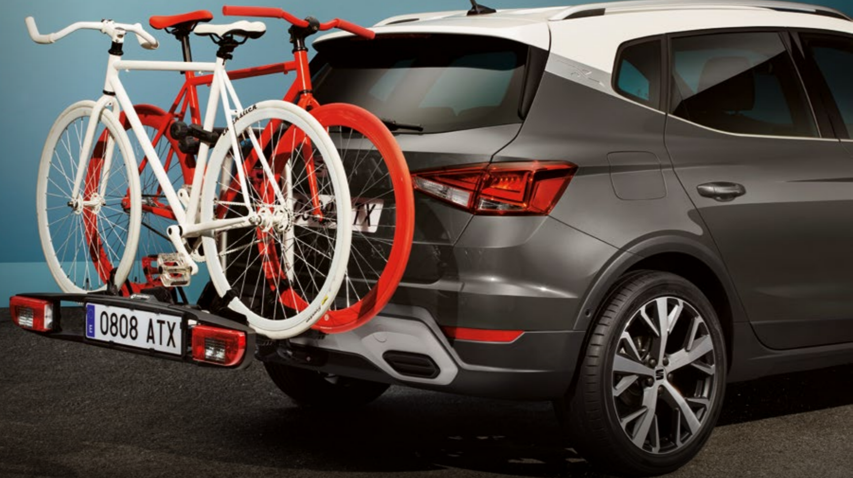
Our global range of cars and product specifications varies from country to country. Please, visit your local SEAT website to know more about the product offer available for you.