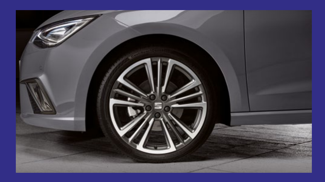
18" Cosmo Grey Wheels. Turn heads with exclusive 18" Cosmo Grey wheels,

perfectly complementing the Graphene Grey exterior.