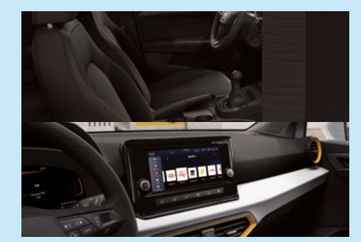
ACERO CLOTH COMFORT SEATS