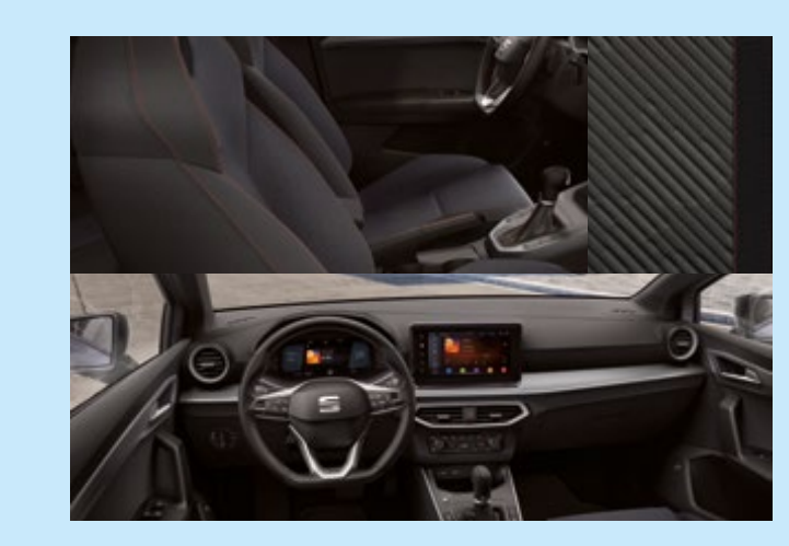
LE MANS CLOTH BUCKET SEATS<sup>2</sup>

Reference R Style S1 Xcellence XC FR FR Serial Optional