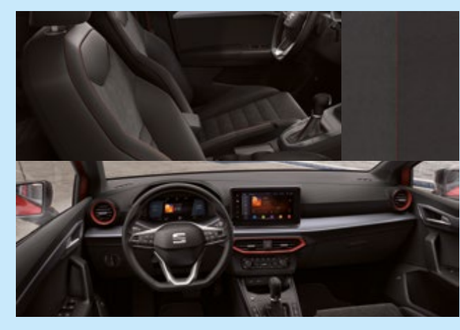
DINAMICA® BLACK SPORT SEATS