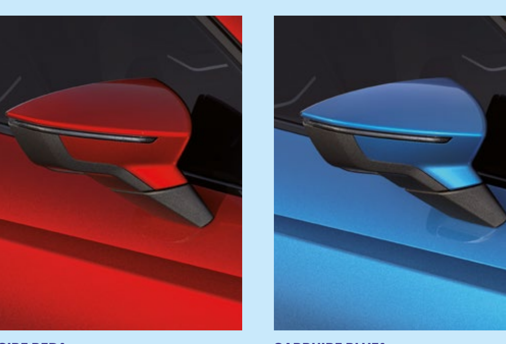
DESIRE RED <sup>3</sup>

<sup>4</sup> Available with Anniversary Pack. <sup>5</sup> Only available for fleet customers (country by country).