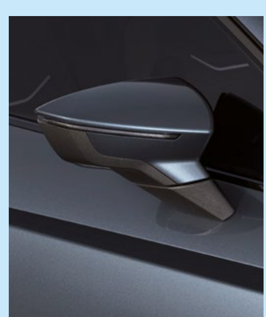
about the product offer available for you. MAGNETIC TECH<sup>2</sup>