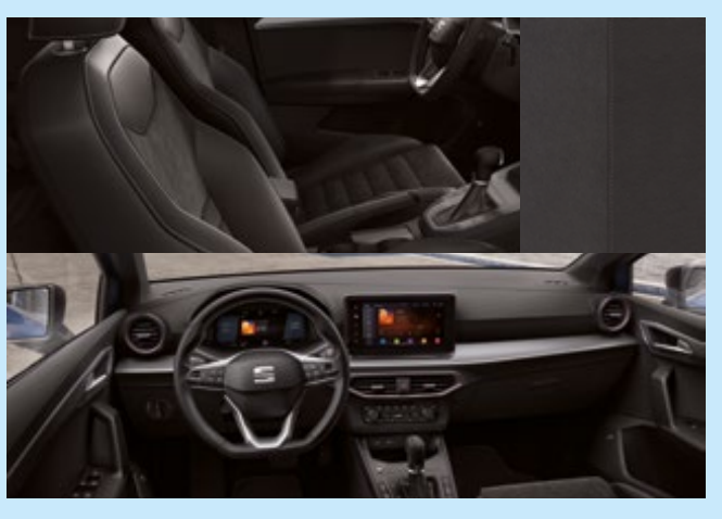
DINAMICA® BLACK SPORT SEATS