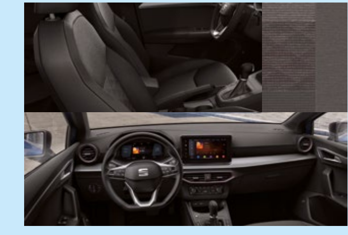
NAO CLOTH COMFORT SEATS