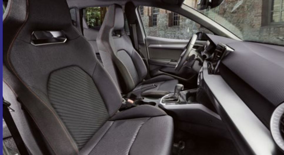
Bucket Seats. Enjoy unparalleled comfort with SEAT Ibiza's first-ever Front Bucket Seats, a hallmark feature of Ibiza's 40<sup>th</sup> Anniversary Pack.

perfectly complementing the Graphene Grey exterior.