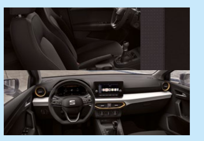
COMO CLOTH COMFORT SEATS