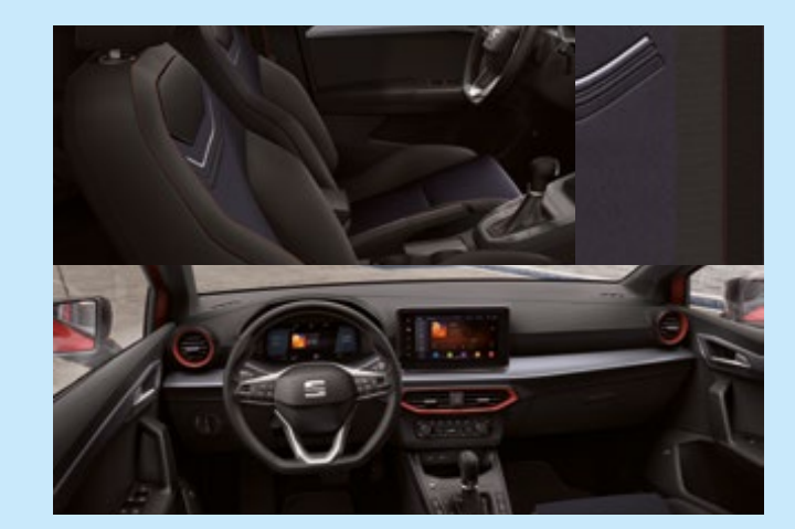
LE MANS CLOTH SPORT SEATS BUCKET SEATS<sup>2</sup>