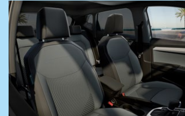
Calella SEAQUAL® Marine recycled upholstery and LABEL blue by BORGERS® carpets.

New dynamic 17" Alloy wheels in Sport Black improve your Ibiza's ride, adding stability and smoother suspension when turning. For a better all-round performance.