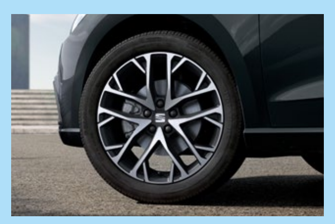
Enhanced performance and handling

The special edition Marina Pack includes new Calella SEAQUAL® Marina fabric, LABEL blue by BORGERS® carpets and is finished off with new 17" Alloy wheels in Sport Black to enhance aesthetic and performance.